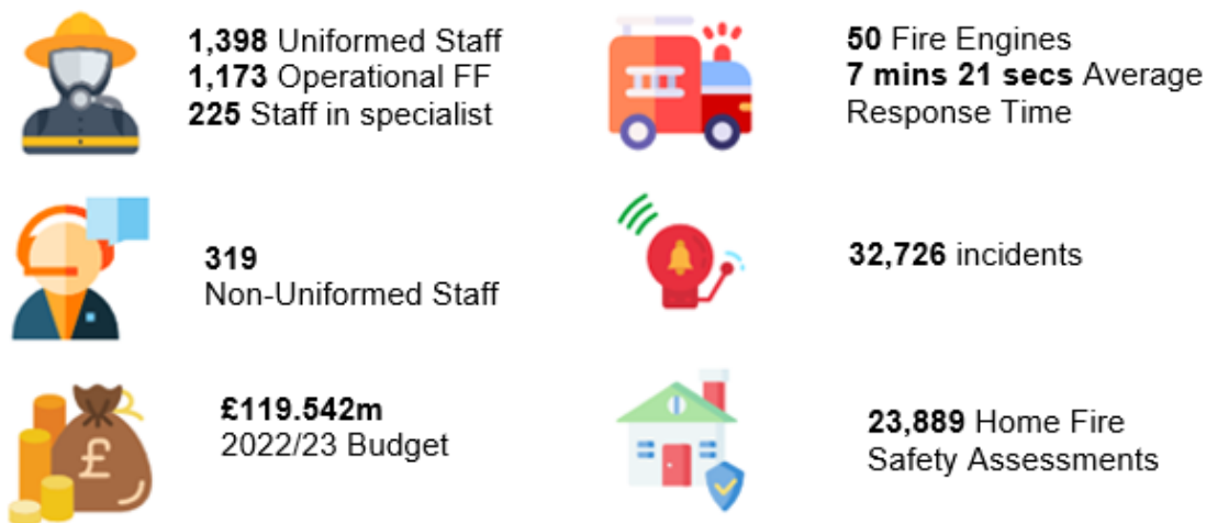
Figure 3: GMFRS overview 2023/24